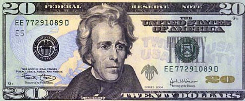
Digitability Dollar Denominations