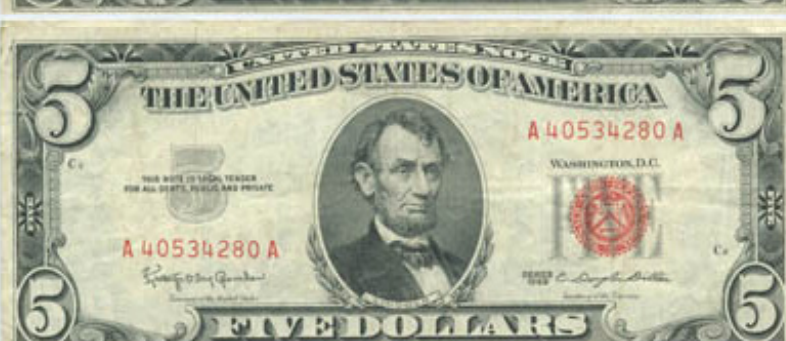
Digitability Dollar Denominations