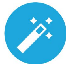
Create your own question