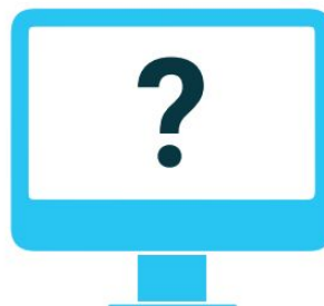
How much time do you spend on the Internet?