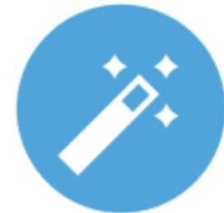
Create Your Own

What questions do you have about your peer's presentation?